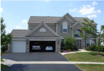
Visitable home in Bolingbrook, IL