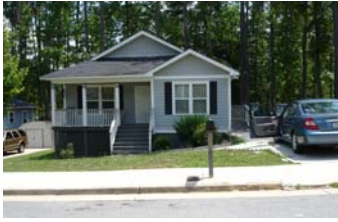
Atlanta, GA Habitat for Humanity visitable home