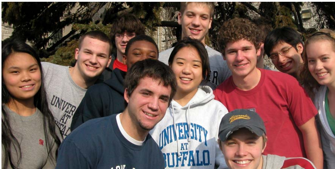
Figure 1. Group of first year students from the architecture program at the State University of New York at Buffalo where diversity issues are incorporated into the curriculum.