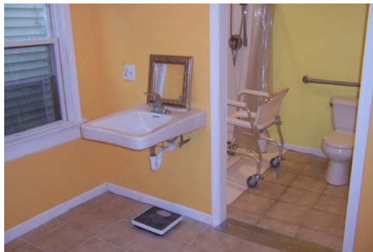
Figures 1 and 2: Images of bathroom modification